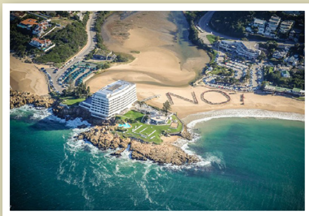
The Plettenberg Bay community spelt out a decisive "NO" on Central Beach to the proposed small harbout development in the Piesang River Estuary.

Should the legal challenges not succeed the Forum will strongly oppose the development on environmental grounds.