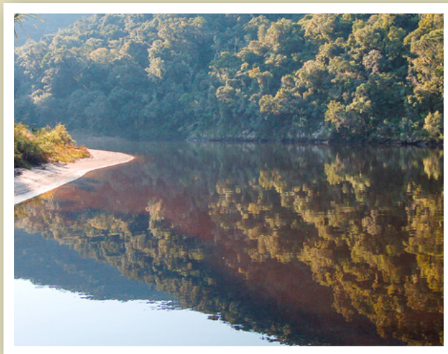
The spectacular Keurbooms River is under threat from alien vegetation and possible over-exploitation.

In recent years the flow of the Keurbooms River has been greatly reduced by invasive vegetation along its course. We are now actively supporting a major alien clearing programme, which will be managed by Eden to Addo.