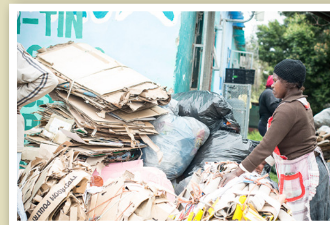
The Win Win Swop Shop based in Qolweni involves the local community in waste recycling.